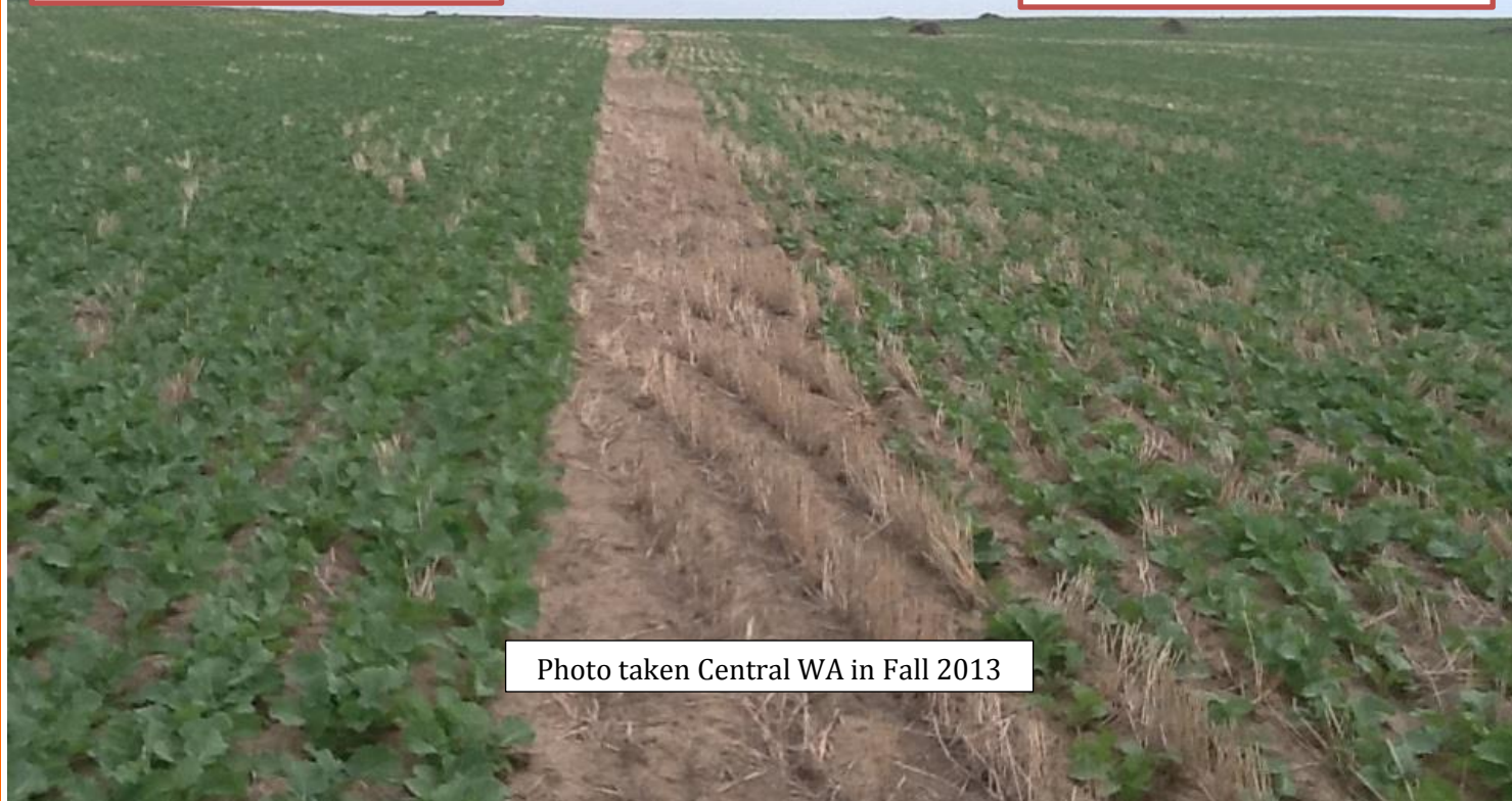
Photo taken Central WA in Fall 2013